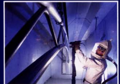
Superior Manufacturing Technology

Cover-All's high performance DuraWeave® covers are virtually maintenance free. The patented double stack weave provides unmatched strength to weight ratios and tremendous rip, tear and puncture resistance. DuraWeave® and DuraWeave® FR covers are backed by 15 and 10 year pro rata limited warranties respectively, and are available in a variety of colors. PVC is available upon request.