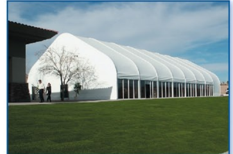
Boulder Creek Golf Club near Las Vegas in Boulder City, NV – 60' (18.2m) wide x 120' (36.5m) long TITAN® building

"The Cover-All facility is a temporary fully functional event center that is generating revenue to construct our future club house expansion. The structure is a complement to the Boulder Creek Golf Club." — Andy Schaper