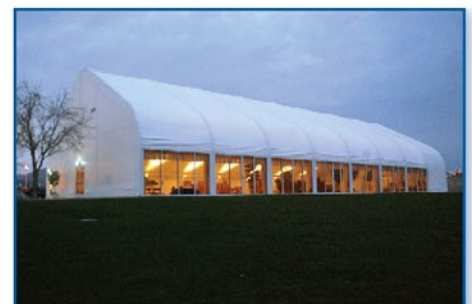
"People love it. We have hosted every type of event you can imagine; from weddings to tradeshow to corporate meetings," says Schaper.