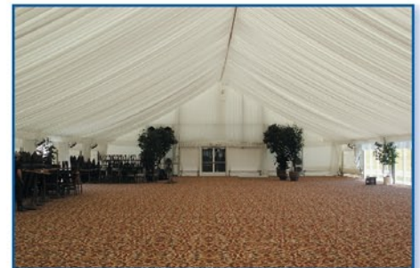
An HVAC system was designed to keep the building comfortably cool during the 120°F (48°C) days and warm during the 25°F (-4°C) nights