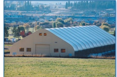
The equine training facility at Brooklyn Stables includes a 70' wide x 260' long Cover-All® TITAN® arena

The present use for the 70 foot by 260 foot Cover-All® building is stabling and training but eventually Cullen hopes to build a much larger Cover-All® training arena and use the existing Cover-All® as a warm-up arena. "For now, the results have been very positive. I'm able to train anytime and can schedule appointments without any weather concerns. The quality of our training has improved and we've been able to more easily retain our competitive edge. It's been a good investment," says Cullen. The dream of building a complete equine facility is becoming a reality with Cover-All!