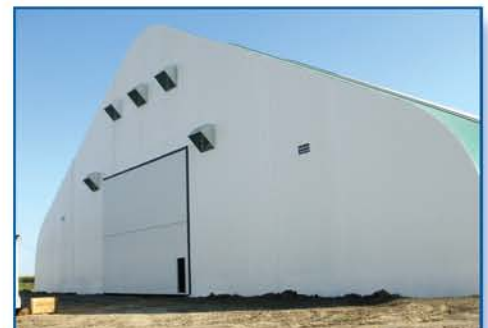
Installation of the Cover-All® building took just ten days to construct.