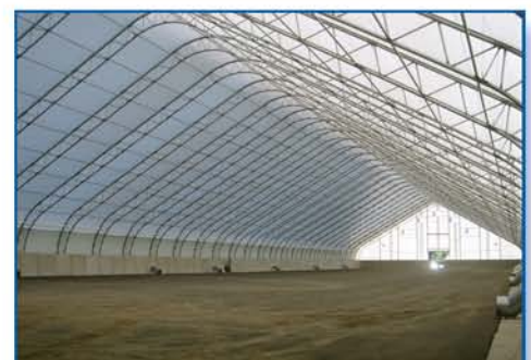
1.5 million bushels of corn will be stored at the Cargill AgHorizons facility.