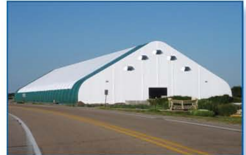
Cargill AgHorizons Corn Storage Facility, Shelton, NE, 160' (48.7m) wide x 600' (182.8m) long Cover-All® TITAN® building.