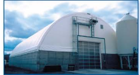
The 62' x 100' Cover-All® Arch™ building was placed on a 10' high concrete wall.

"We now have a suitable facility to store a large amount of product," says Wieck. "The urea looks as good coming out as it did when it went in. There is no sweating or bonding of product and the floor isn't slippery. The high ceiling and ventilation system keeps the quality of the urea consistent and has eliminated any ammonia odor. The building is cool in the summer and allows natural light. The additional benefit is that we can store our custom application units in the building when the building is empty. We are extremely pleased with the investment."