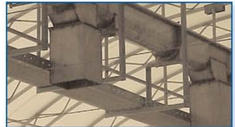
The 21 arch trusses were placed 5' on centre to support catwalk and conveyor system and to meet wind and snow loads.