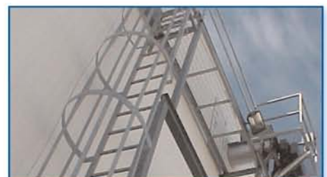
Cage fire escapes were added to both ends of the building for maintenance access and to meet Federal safety regulations.