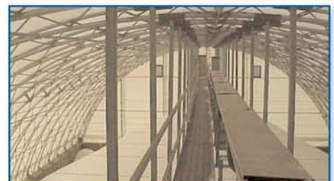
Full load numbers for the 12" conveyor and catwalk system were 200 lbs. per square foot.