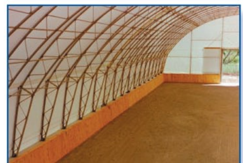
The interior perimeter of the arena features 5' high kick boards made of tongue and groove knotted pine