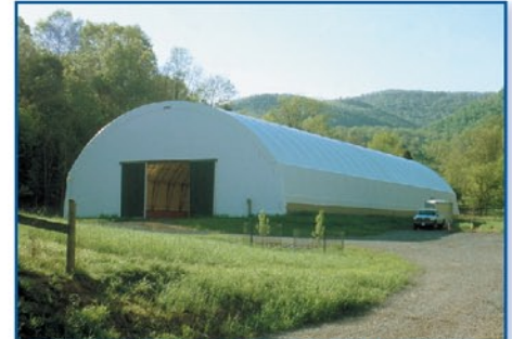
Gustafson's riding arena in Salem, Virginia - 72' x 220' Arch building

"The sense of openness and peaceful acoustical qualities of the building provide the natural environment that horses and riders love..." Judy Gustafson