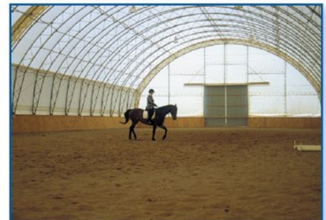
The installation of the arena took only 9 days