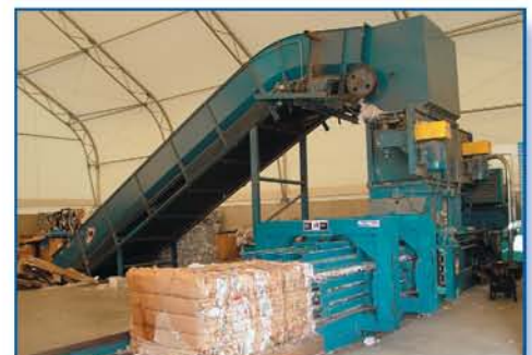
The large clear-span work area provides plenty of room to move the 2,000 lb. bales.