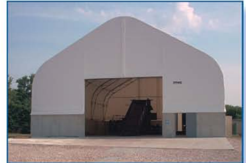
Two large entranceways provide easy access for large machinery and equipment.