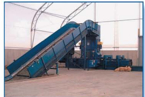
The new baler and TITAN building increased handling capacity by 30 percent.