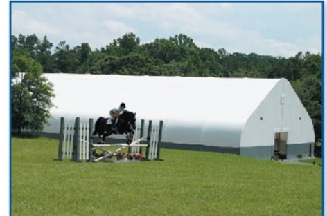
The Meadows at Lake Norman riding arena in Huntersville, NC - 90' x 200' TITAN building.

"I love my Cover-All arena. There is a wonderful natural environment when you ride in this building." Jeanne Jamison