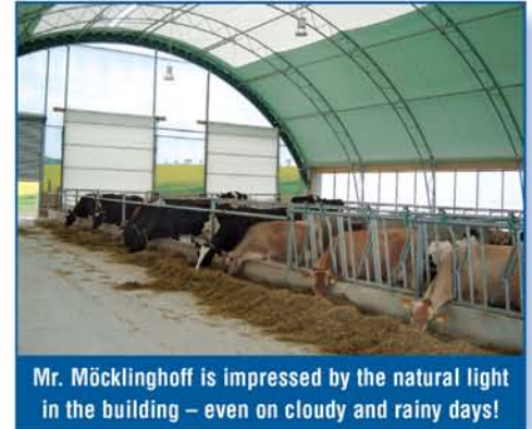
Mr. Möcklinghoff is impressed by the natural light in the building – even on cloudy and rainy days!