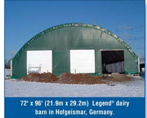
72' x 96' (21.9m x 29.2m) Legend® dairy barn in Hofgeismar, Germany.