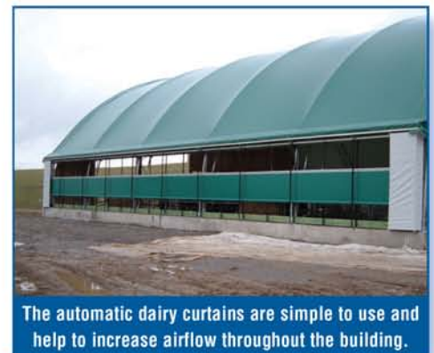
The automatic dairy curtains are simple to use and help to increase airflow throughout the building.