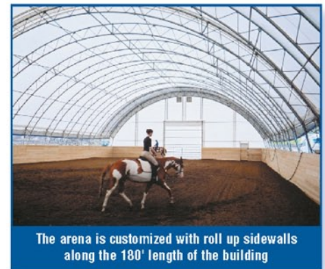
The arena is customized with roll up sidewalls along the 180' length of the building