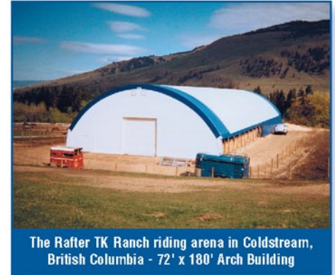
The Rafter TK Ranch riding arena in Coldstream, British Columbia - 72' x 180' Arch Building

"When we walked into a Cover-All arena, we knew we had found the right building. The natural light, ventilation and wide open space provided a feeling of not being enclosed at all!" Ted Scott