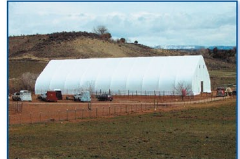
The Vickrey's arena - 100' wide x 200' long Cover-All TITAN® building.

"Unquestionably, our business will grow because of our Cover-All. We're making more progress and our horses are making more progress." Gary Vickrey, NV Equine