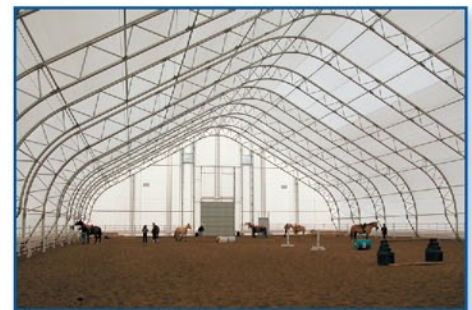
Gary and Sandy grew their passion for horses into a full-time training business.