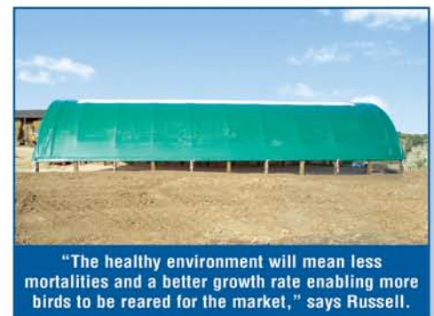
"The healthy environment will mean less mortalities and a better growth rate enabling more birds to be reared for the market," says Russell.

"The healthy environment will mean less mortalities and a better growth rate enabling more birds to be reared for the market."